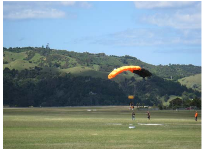
After – about to touch down – Phew!!!